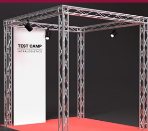
* Sample image, booth construction may vary.

https://testcamp-intralogistics.com/en/request-quote-test-camp